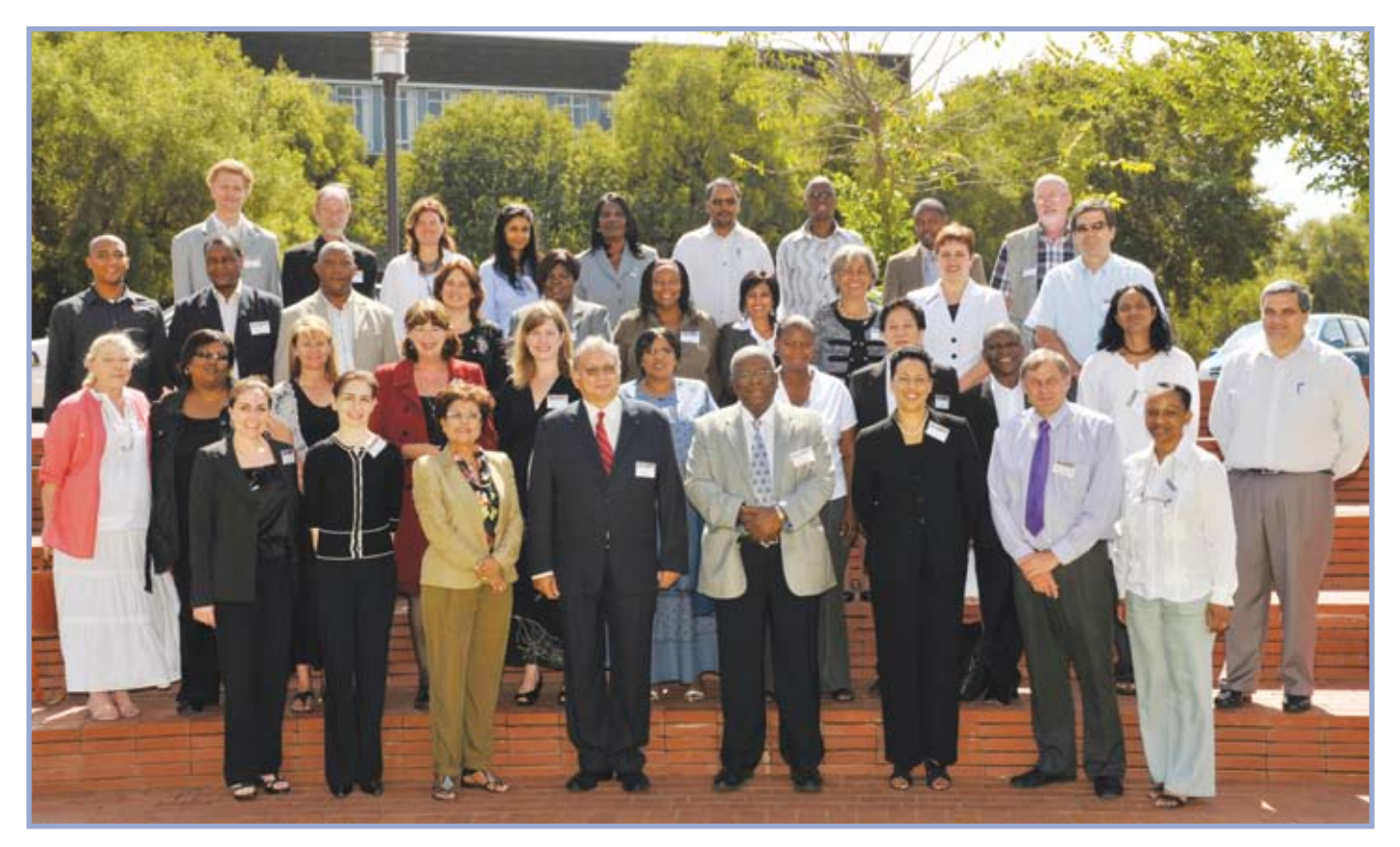
Delegates at the Fifth Commonwealth Teacher Symposium

The symposium concluded by committing to effectively promoting strategies to protect teachers across borders and uplift the morale of teachers.