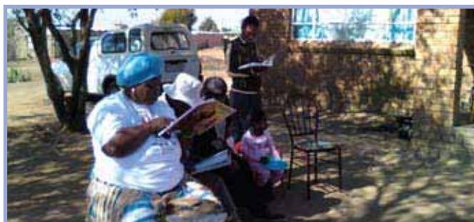
Reading to the children at Boitumelo Community Centre.