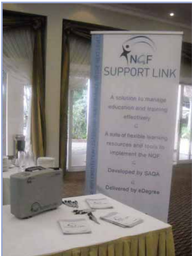
NGF Support Link stand at the Merseta exhibition.