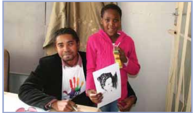
An artist from the Nelson Mandela Foundation drew portraits of the children.