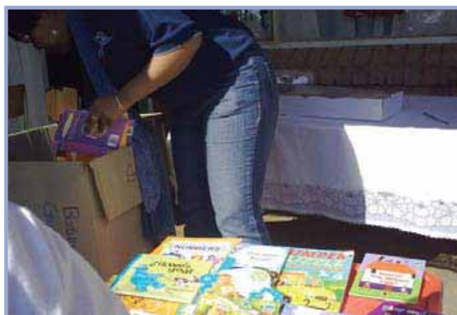
Some of the books donated by SAQA.