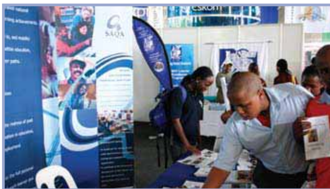
Learners at the SAQA stand.