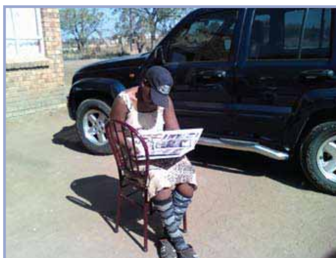
This youngster couldn't wait to start a new book.

Our Mandela Day celebrations were overwhelmingly successful thanks to SAQA staff, who worked tirelessly to bring joy to children who need support, and our partners, Maskew Miller-Longman, the Nelson Mandela Foundation and the SABC. SAQA's support for these homes is ongoing and we are building good relationships with the children and their caregivers.