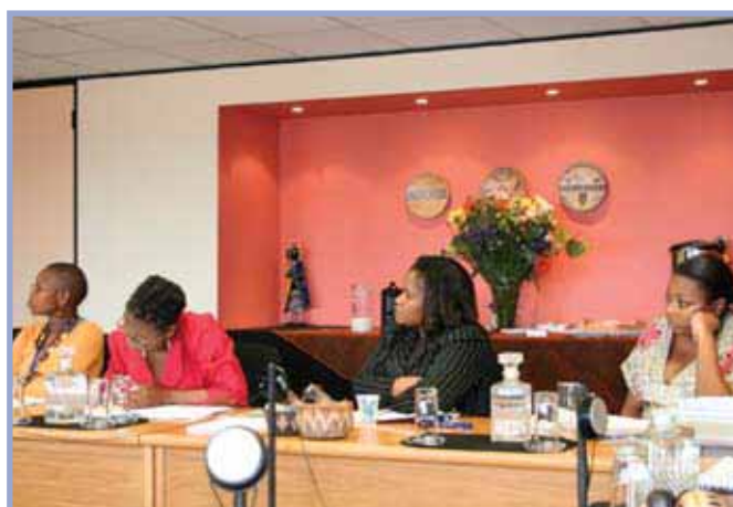
Participants at a workshop on the NQF Support Link.