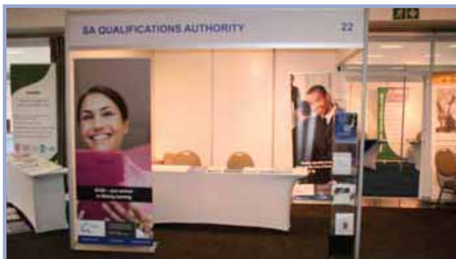
The SAQA exhibition stand.