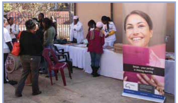
Distributing books at Sunnyside Home of Hope.