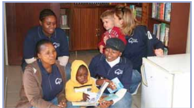
SAQA volunteers at Sunnyside Home of Hope.