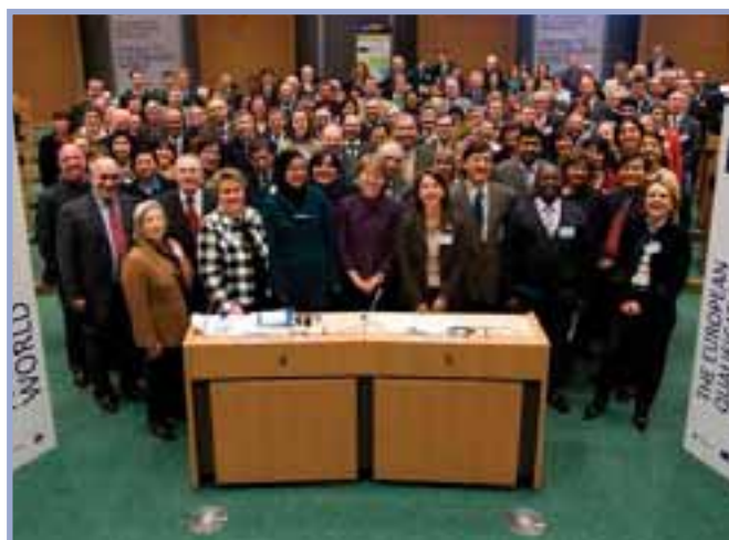
Delegates at the ETF International Conference in Brussels.