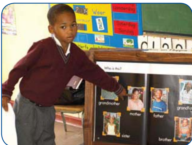
One of the many aspects the Impact Study will consider is the progress of learners through the schooling system

While it is likely that certain features of the education and training system will begin to show the effects of the NQF in a relatively short time, others will take much longer to show impact. International experience indicates that the effects may manifest themselves as follows: