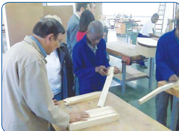
A carpentry class at Coastal KwaZulu-Natal College in Durban