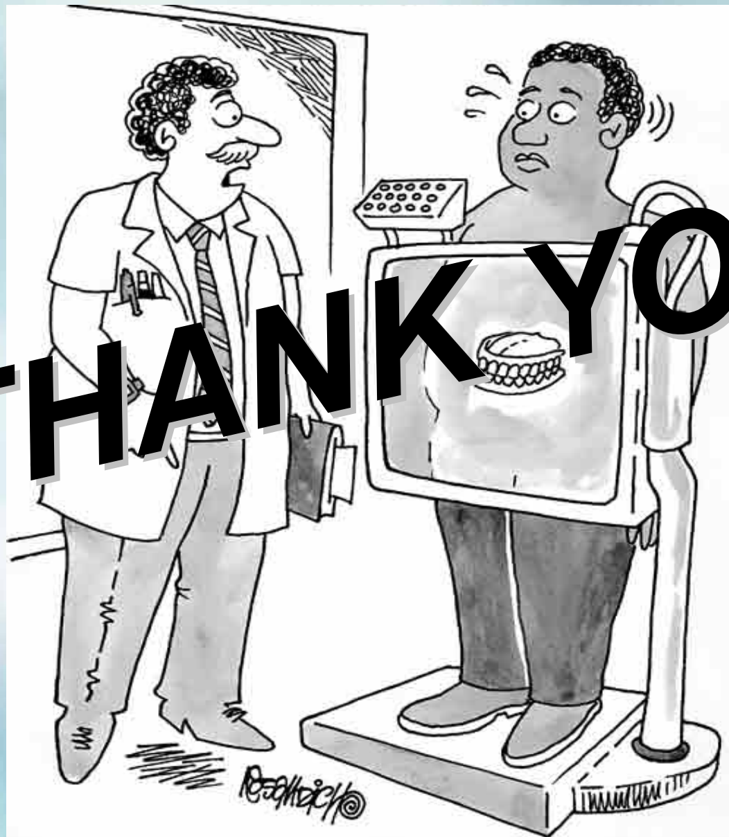
"I think I know what's causing that gnawing feeling in your gut."